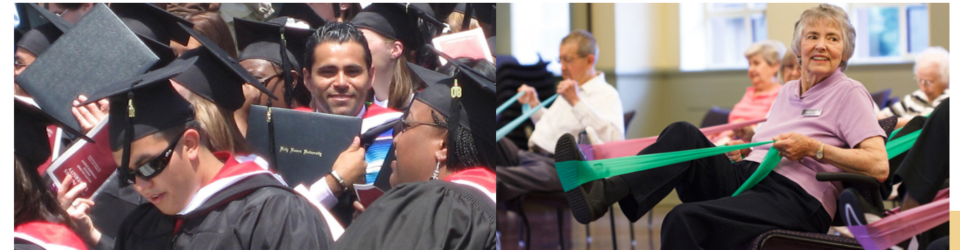
Ministries in Oakland, CA and Marylhurst, OR