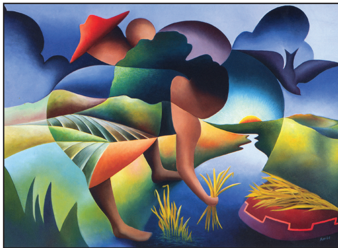
The Sowers by Nancy Earle

The United States has historically considered itself as a nation of immigrants. With a global reputation as a country of opportunity, the US draws immigrants from across the world. In recent decades, the stringency of US immigration policy has increased exponentially. Following the attacks on 09/11/2001 the US Government enacted laws and policies that raised the scrutiny of foreign-born nationals, as well