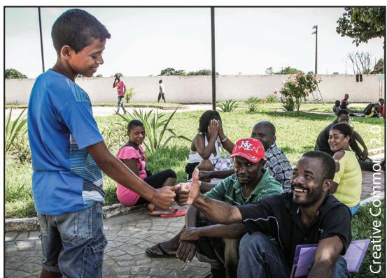
Haitian refugees in Brazil

including concern for indigenous communities whose constitutional rights have been changed without dialogue with the affected communities; criminalization of communities, people and social movements; and the killing of youth, especially those who are poor and black.