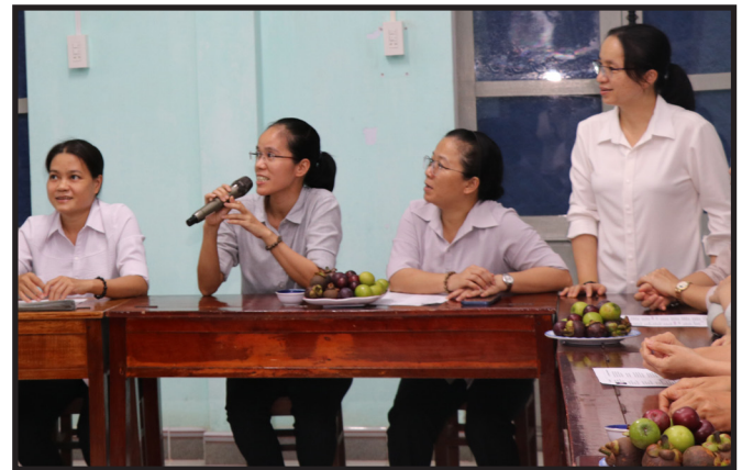
Bottom: English students gathering

The LHC Congregational leaders have indicated that, currently, their priority is sending younger Sisters to complete advanced degrees that meet their needs for specific skill sets. I look forward to working with prospective students and to ongoing conversations with the LHC leadership as we collaboratively develop effective approaches to meet their current English language priorities. I'm excited to see what new paths this thoroughly intercultural ministry may take.