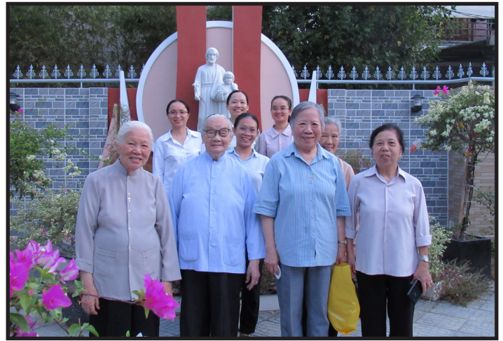
Top: Phu Cam local community of LHC.